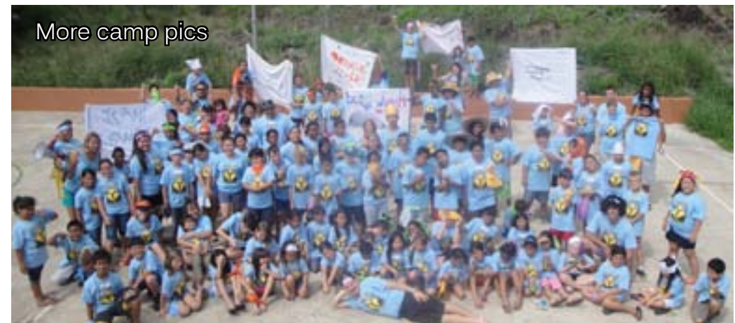
More camp pics

Thursday: District Assembly @ 9:00am-noon