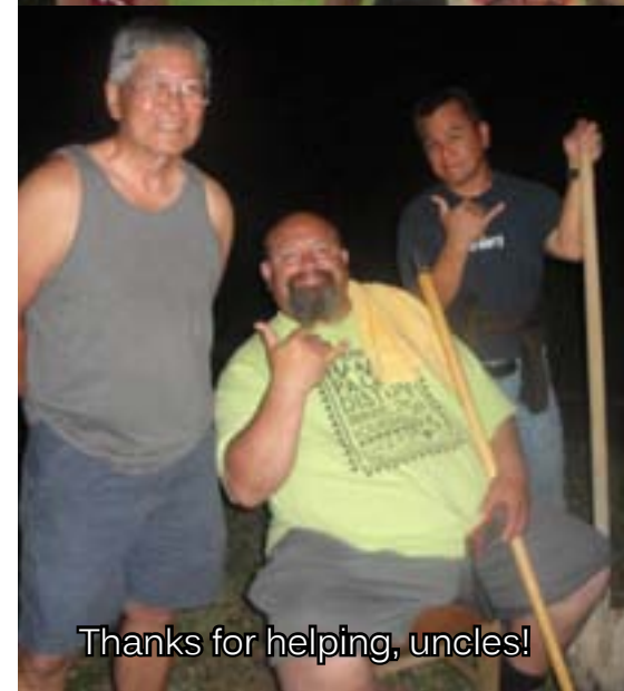
Thanks for helping, uncles!