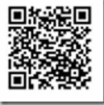
July 11 Westwood Express

Scan these QR Codes using your smartphone's QR Reader application to read the current issues of: