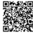
July Westwood World

UNIFIED OFFERING Due to computer/technical issues, there is no updated financial information this week.