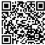
4/18 Westwood Express

Scan these QR Codes using your smartphone’s QR Reader application to read the most recent issues of: