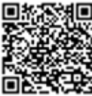
April Westwood World

Please print and place in Offering Plate.