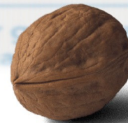
in a nutshell