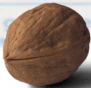
in a nutshell