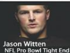
Jason Witten NFL Pro Bowl Tight End