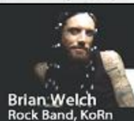
Brian Welch Rock Band, KoRn