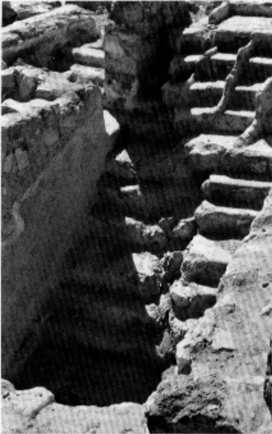
Staircase leading to a cistern at Qumrân. Purification by means of a ritual bath was an important part of the life of the covenantal community. (W. S. LaSor)

Other historical evidence indicates that baptism by immersion has its roots in the Jewish “mikvah”. A ritual bath deemed necessary before going before God. 1 st century Judaism reveals that one entered as one individual and exited as another prepared to serve in God’s presence. This picture comes from The International Standard Bible Encyclopedia (W. B Erdmans: 1992) page414,