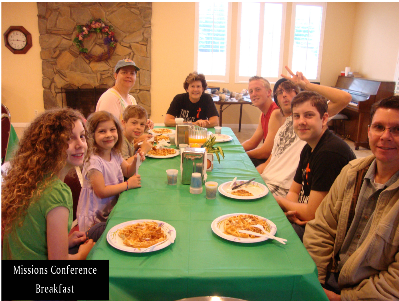
Missions Conference Breakfast