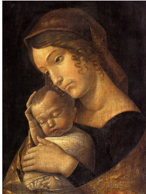
Mary and Child by Andrea Mantegna

The incarnation, birth of Christ, deity inhabiting humanity, has fascinated the people of God from the beginning of God's promise. We hear faint echoes of it in Genesis 3: the seed of the woman will crush the head of the serpent. But how? Can a man crush this supernatural being, the enemy of our souls, the devil, and still be a man?