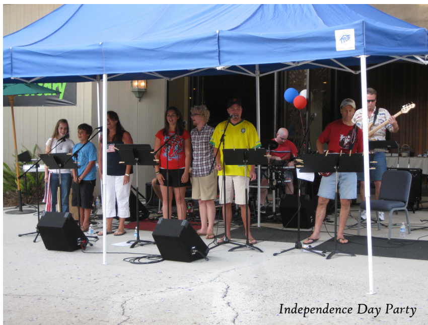
Independence Day Party