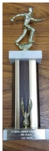
Shown above Leo Brown Bowling Trophy from 79-80 Season 2nd place