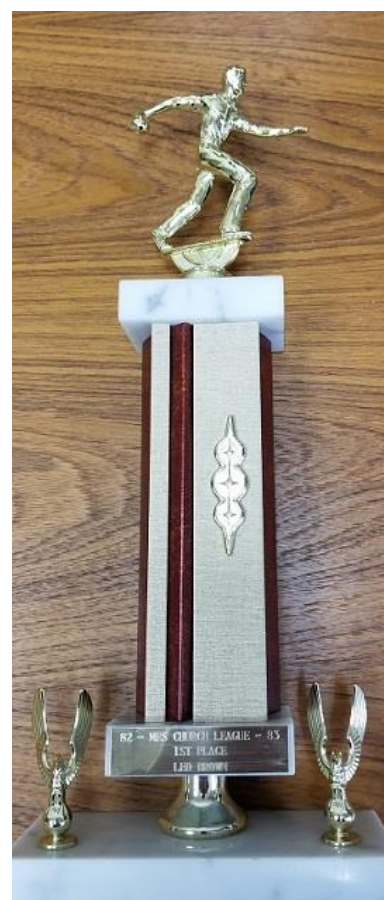
Shown above Leo Brown Bowling Trophy from the 82-83 Season 1st Place