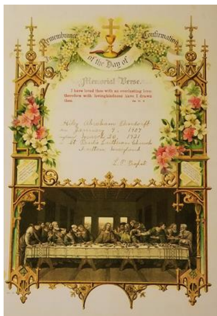
Remembrance of the Day of Confirmation