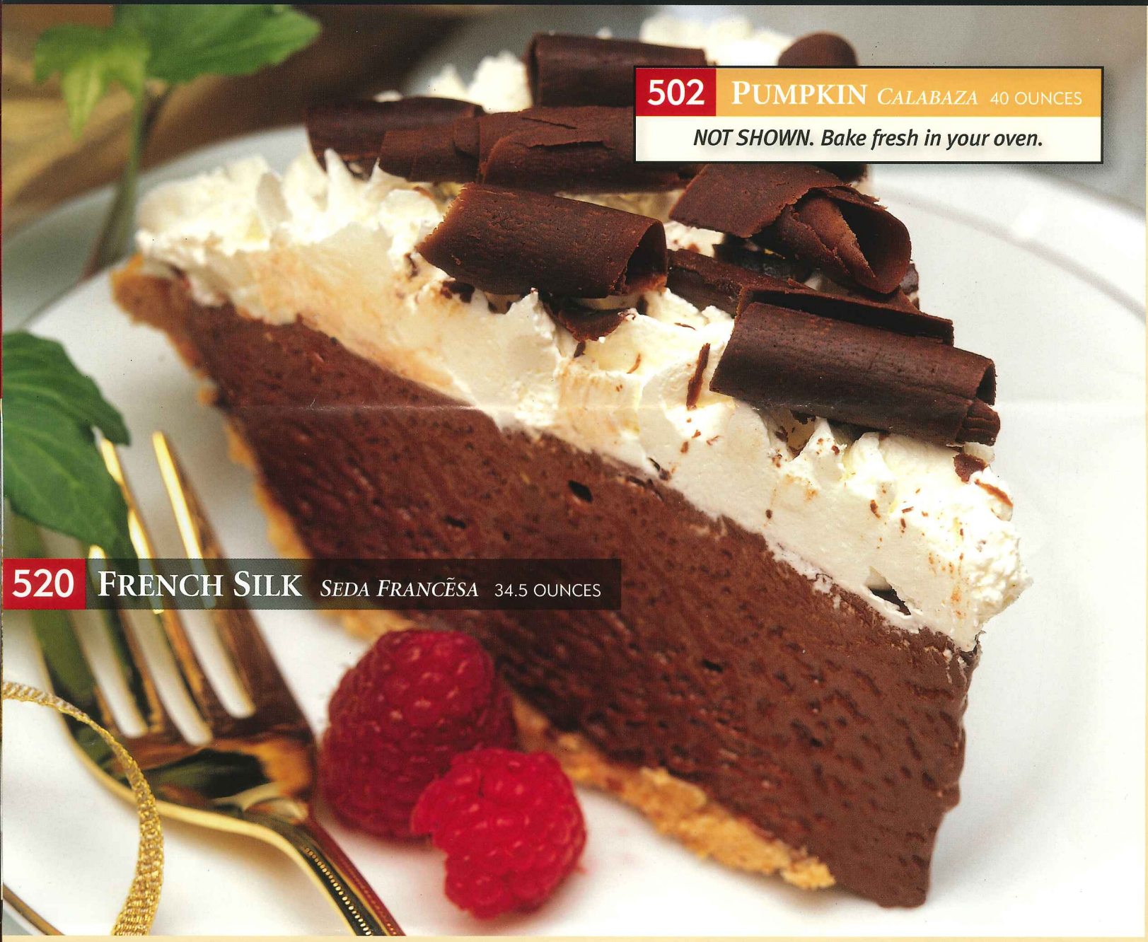
502 PUMPKIN CALABAZA 40 OUNCES