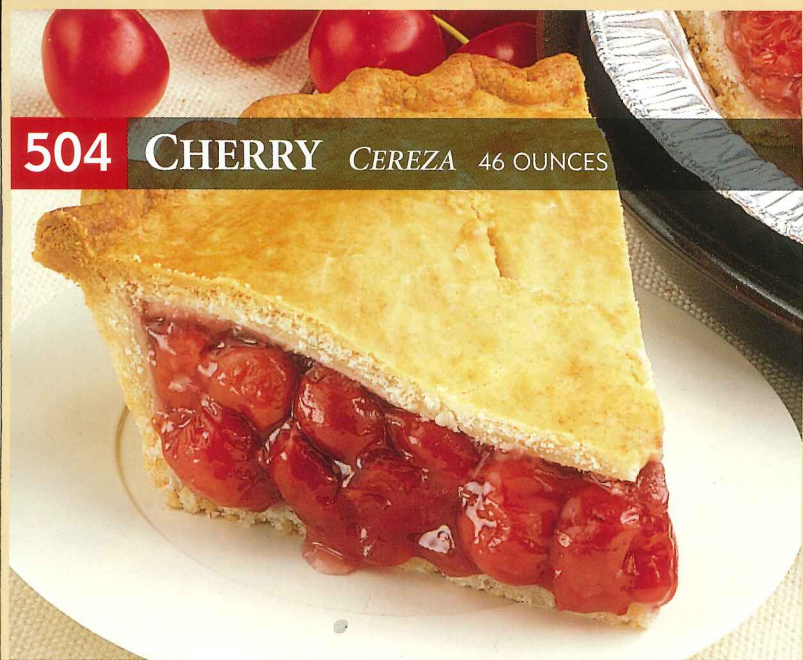
504 CHERRY CEREZA 46 OUNCES