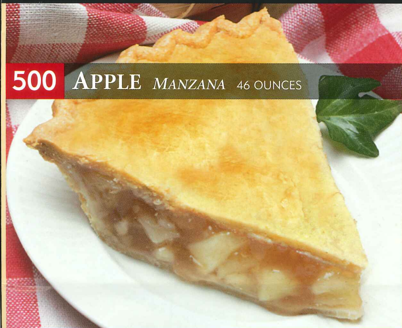
500 APPLE MANZANA 46 OUNCES