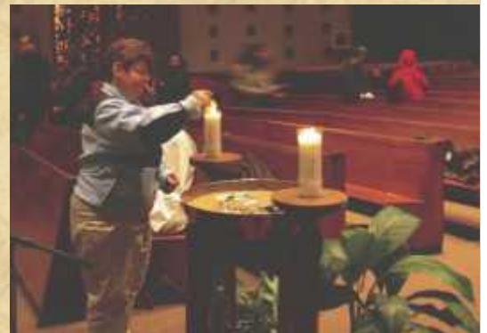
Reconciliation “Heal Me, O Lord”