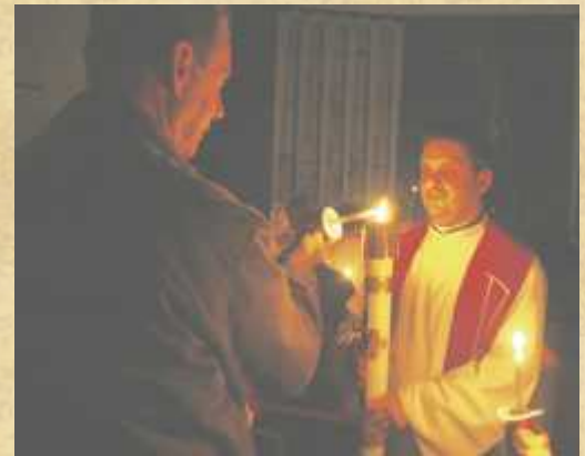
Light and Darkness “O Lord, Come to Me”