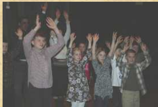
Big Steps, Little Feet... I may be small but he lives in me!