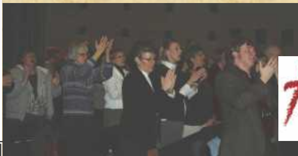
Becoming the Presence of God “We Remember Your Love”