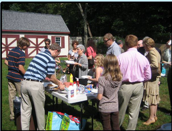
Parish Picnic on Sunday, September 25th