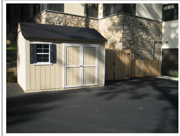
New storage shed and fencing to hide unsightly garbage bins