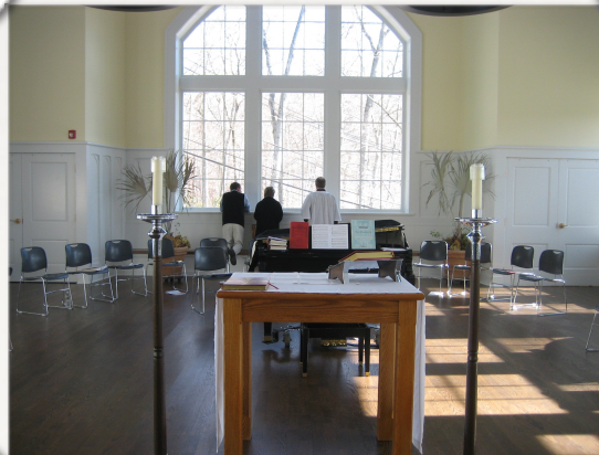
Peering out of the memorial window to peek at the fallen tree that caused the power outage.