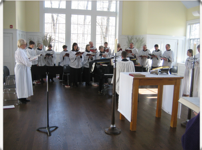
Service in the Parish Hall