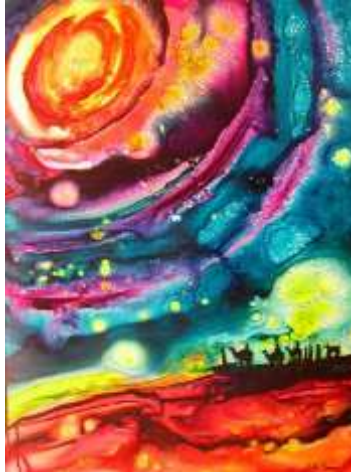
“Magi” by Della Conroy