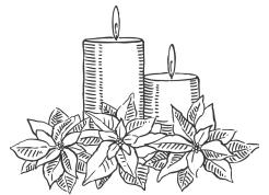
I will never forget you. Isaiah 49:15

This year we will especially remember our deceased parishioners from the past year during the All Souls Day