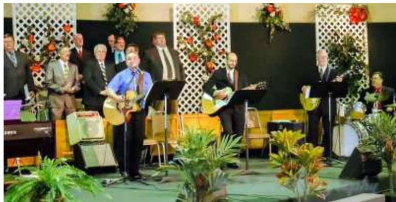
Pastoral Praise Band at District Assembly