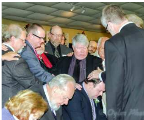
Laying of hands on the ordinands