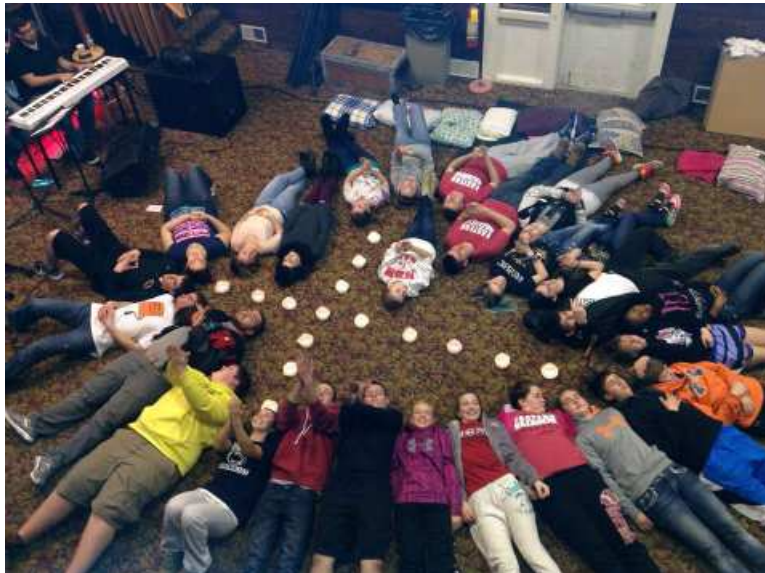
Winter Retreat South