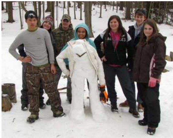
Winter Retreat North