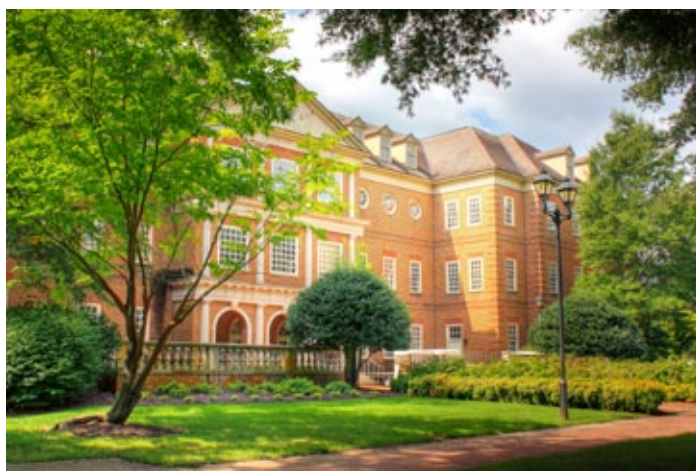
Robertson Hall at Regent University, Virginia Beach, Virginia, host site of the 41st Annual Meeting of the Society

The third session turns to church growth within Pente-