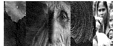
2017 LOTTIE MOON CHRISTMAS OFFERING!

Youth Outing – Christmas Lights in Moncks Corner (Bus Reserved)