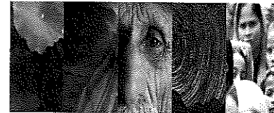
2017 LOTTIE MOON CHRISTMAS OFFERING*

Keystone Class Adult Christmas Party (Bus Reserved)