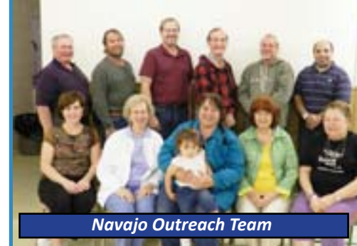
Navajo Outreach Team