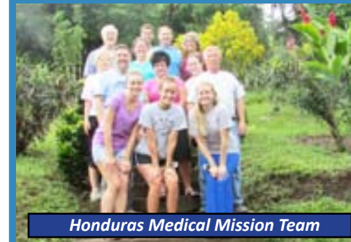
Honduras Medical Mission Team