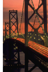
Caption describing picture

to the church and a group of folks came over and helped out at the Sokol Sale to box up the remainder of their sale merchandise. They will be storing the goods until our next available sale.