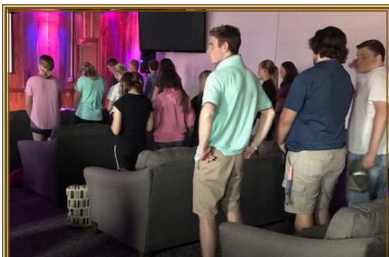
Calvary Community Church, St Cloud MN Night of Prayer for Nicaragua August 5, 2018