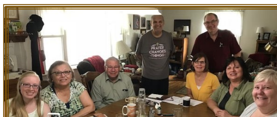
RBW Annual Board of Directors Meeting, August 18, 2018

"Blessed be the God and Father of our Lord Jesus Christ! According to His great mercy, He has caused us to be born again to a living hope through the resurrection of Jesus Christ from the dead, to an inheritance that is imperishable, undefiled, and unfading, kept in heaven for you, who by God's power are being guarded through faith for a salvation ready to be revealed in the last time. In this you rejoice, though now for a little while, if necessary, you have been grieved by various trials, so that the tested genuineness of your faith - more precious than gold that perishes though it is tested by fire - may be found to result in praise and glory and honor at the revelation of Jesus Christ." 1 Peter 1:3-7 (ESV)