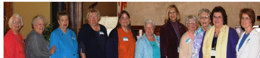
PWSK Coordinating Team 2016-2017