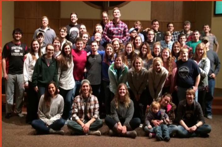
Just under 50 young adults attended Young Adult Winter Retreat at Westminster Wood Camp January 8-10, 2016