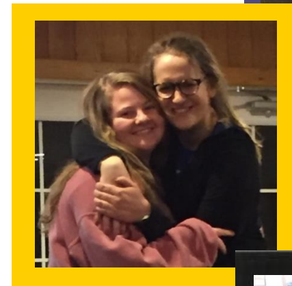
Renewed & Spirit Fed!