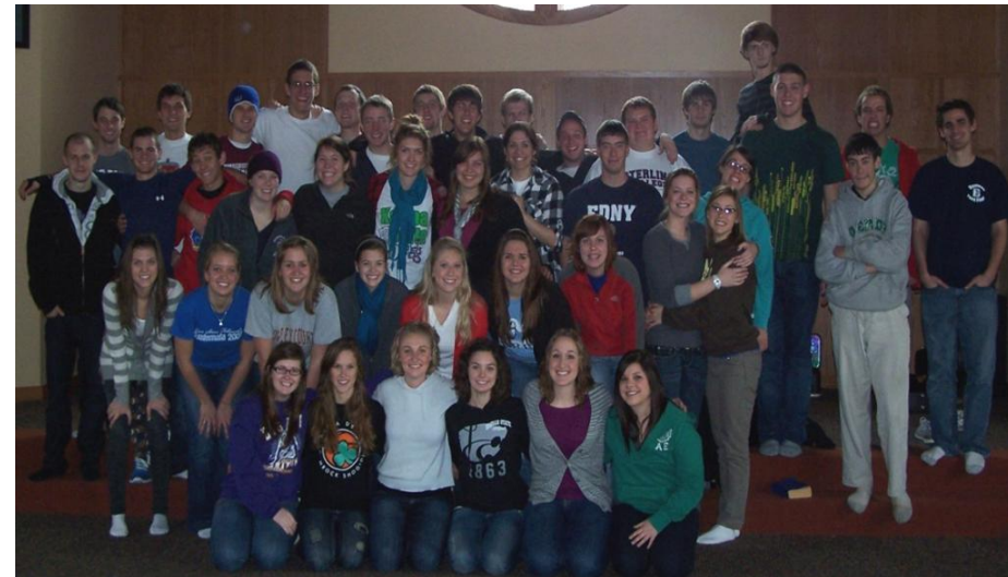
Young Adult Retreat – January 2011

See the website for more details: westminsterwoodscamp.com