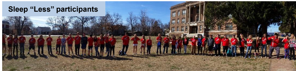
Sleep "Less" participants