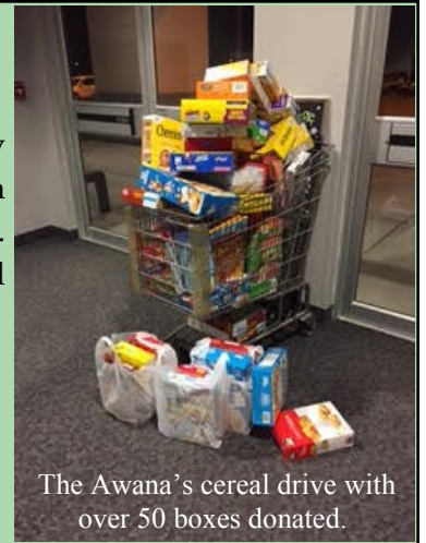
The Awana's cereal drive with over 50 boxes donated.

The November food pantry served 140 families which is the highest number of guests served since the pantry started. Our shelves are bare but we are trusting that what is needed for our December pantry be provided. Our hope is to give each family a turkey or a ham as well as a plate of homemade cookies (and the usual bag/bags of food). In November, we handed out 254 bags of food. If you have any questions about how you can help with the December pantry, please ask any of the pantry volunteers. We plan to use points at Plum Creek Market Place to purchase turkeys, so if you have points you want to donate to the church, just let one of the managers at the store know and they can help you with that.