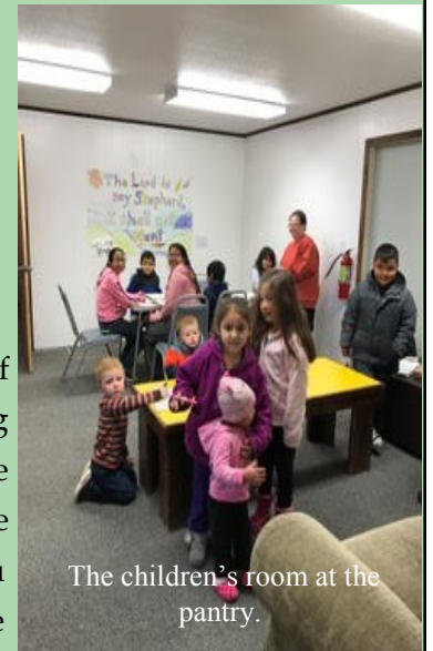
The children's room at the pantry.