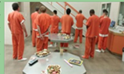
Men with their plates of cookies

the plates at the church between Christmas Eve services. Any one wanting to make cookies for this can drop the cookies off at the church anytime before or bring them with you when you come to the first Christmas Eve Service. The Jail Ministry wants to thank you for your support over the many years. You are an awesome church family and we wish you a Merry & Christ centered Christmas.