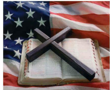
...One Nation Under God...