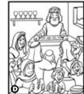
The early church broke bread and shared stories about God.