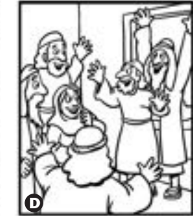
The early church gathered to worship.