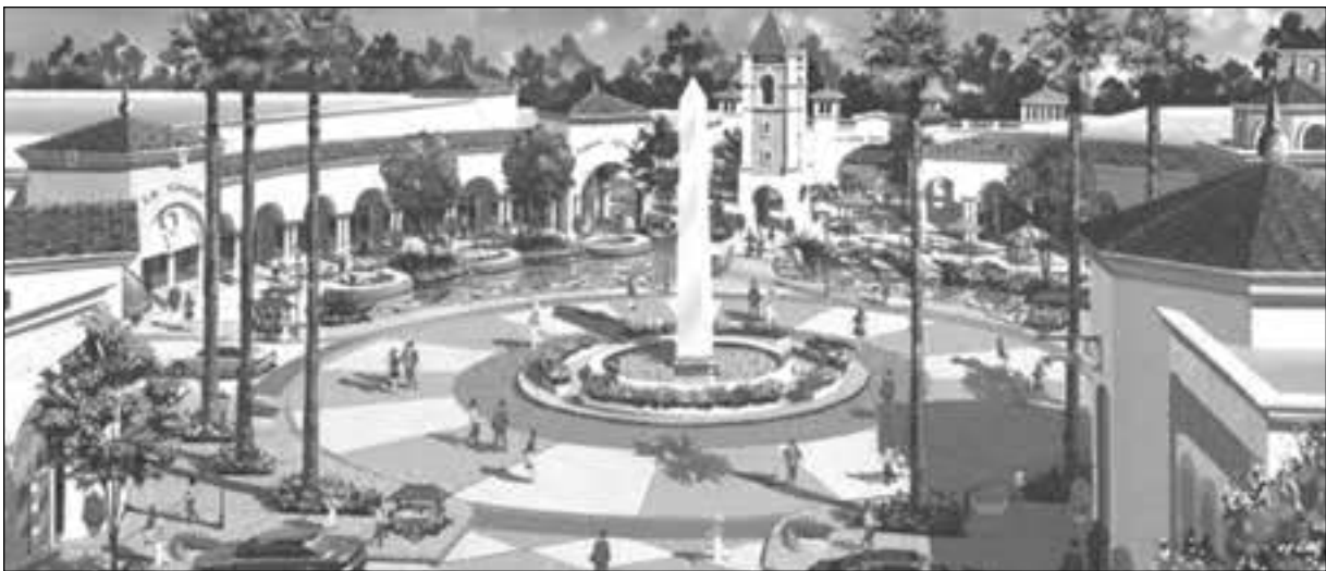
An artist's rendering of the Cameron Pointe Town Center Plaza.