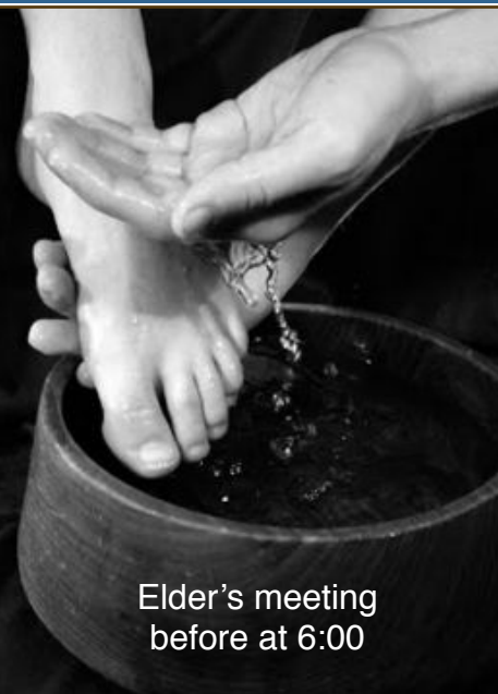
Elder's meeting before at 6:00