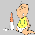
Baby & Toddler