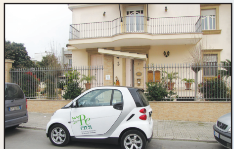
Counseling and training center; Smart car has new logo and name