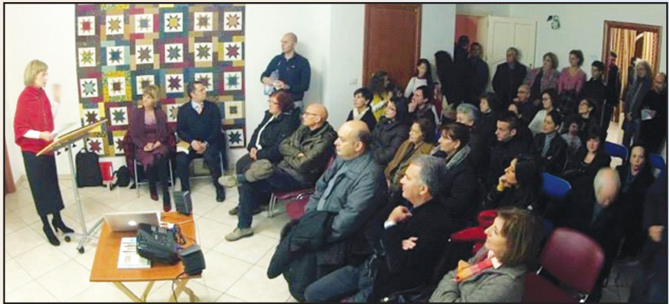
Caranita speaking for the Inauguration