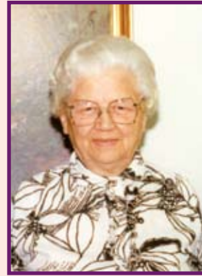
archive photo, circa 1990