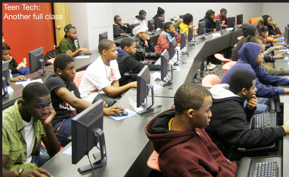
Teen Tech: Another full class