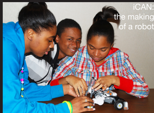
iCAN: the making of a robot