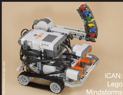
iCAN: Lego Mindstorms