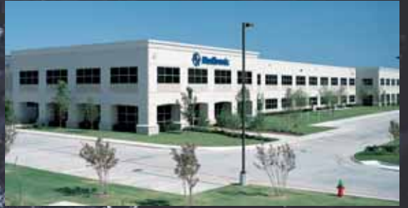
Medtronic – Building Type