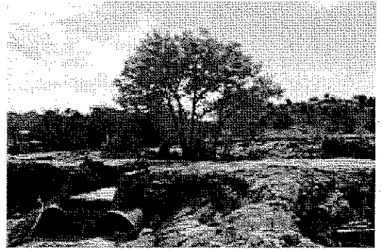
Arroyos have been raging all through New Mexico as a result of the severe storms.

Because Ghost Ranch has a $100,000 deductible on its flood insurance policy, all gifts are welcome. Visit the Ghost Ranch website to make an online gift.