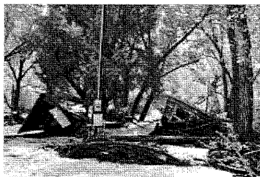
Flooding swept through the arroyos on Ghost Ranch's property causing massive damage.