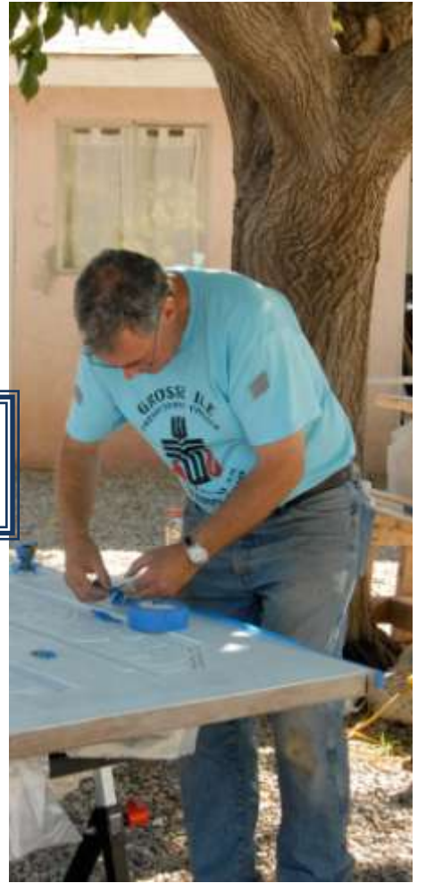
It Takes A Village ..... The creation of Casa Rosa