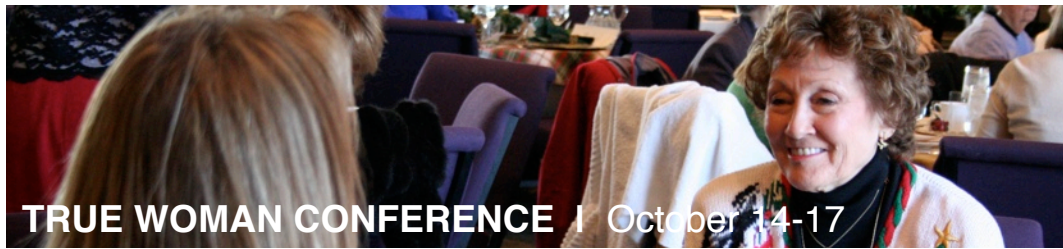
TRUE WOMAN CONFERENCE | October 14-17