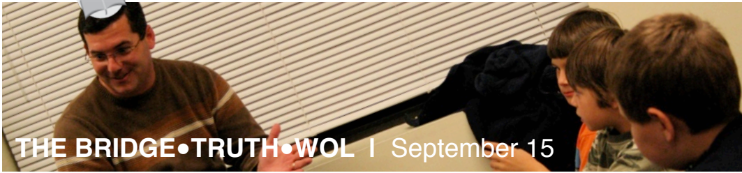
THE BRIDGE • TRUTH • WOL | September 15