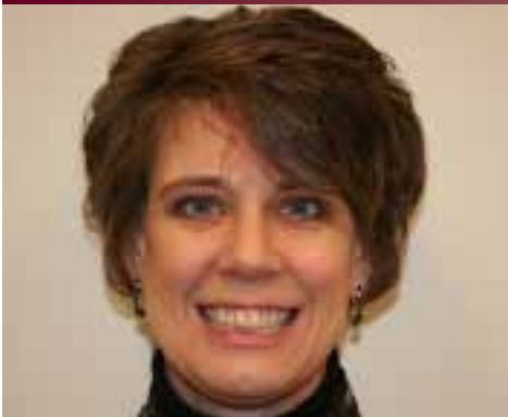
ANNE HUTCHINSON TOT SPOT