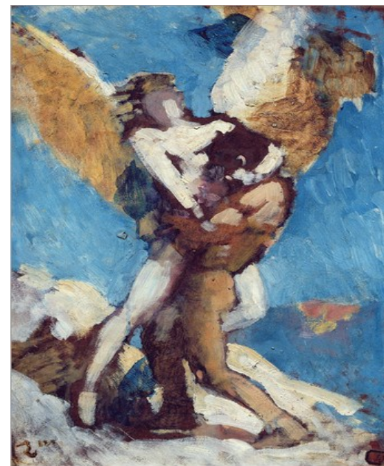
Jacob Wrestling With the Angel by Leon Florentin Joseph Bonnet, 1876

Welcoming all people in the name of Christ. Expressing the love of God to the World. Trusting the Power of the Holy Spirit as we serve the Kingdom of God.