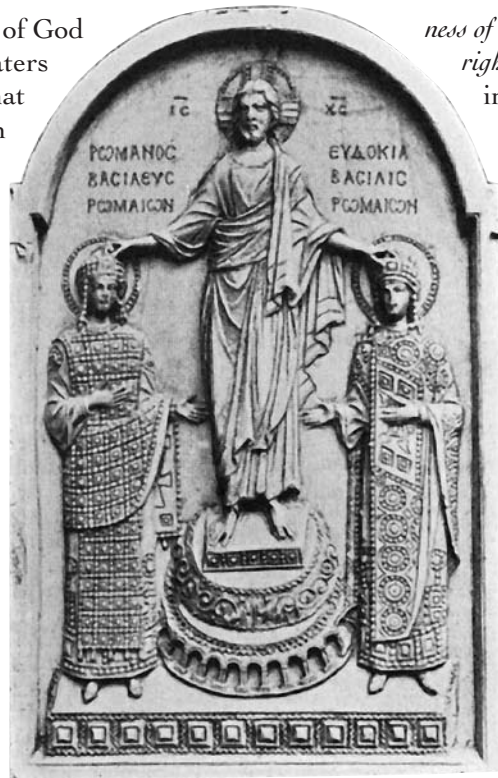
Christ blessing a royal couple, 11th century ivory panel

“The newly-baptized person has been freed from what the slavery of the Israelites symbolized.”