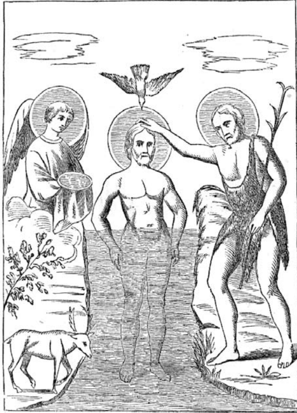
Baptism of Jesus by John, fresco in a 5th century catacomb near Rome

was to prefigure the true “Passover.” The bondage of the Israelites symbolized the bondage that has affected all humanity since the fall of Adam and Eve, the real bondage to sin and the power of the devil. And it is this bondage that we are liberated from by the precious Blood of the true Lamb of God, Jesus Christ, “ who takes away the sin of the world ” (Jn 1:29; see also Jn 3:16; Rom 6:23; Heb 2:14-15; 1 Jn 3:8).