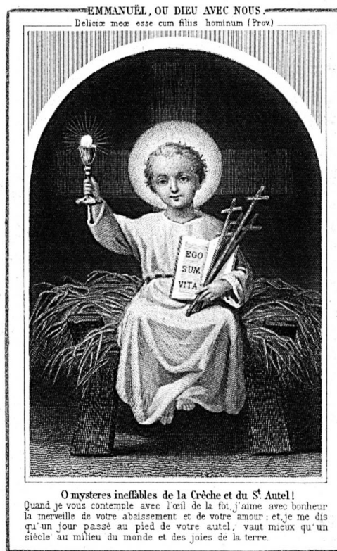
Holy card expressing devotion to the Child Jesus.

"His holiness was so overwhelmingly apparent that at times he inspired sinners to repentance merely by the sight of him."