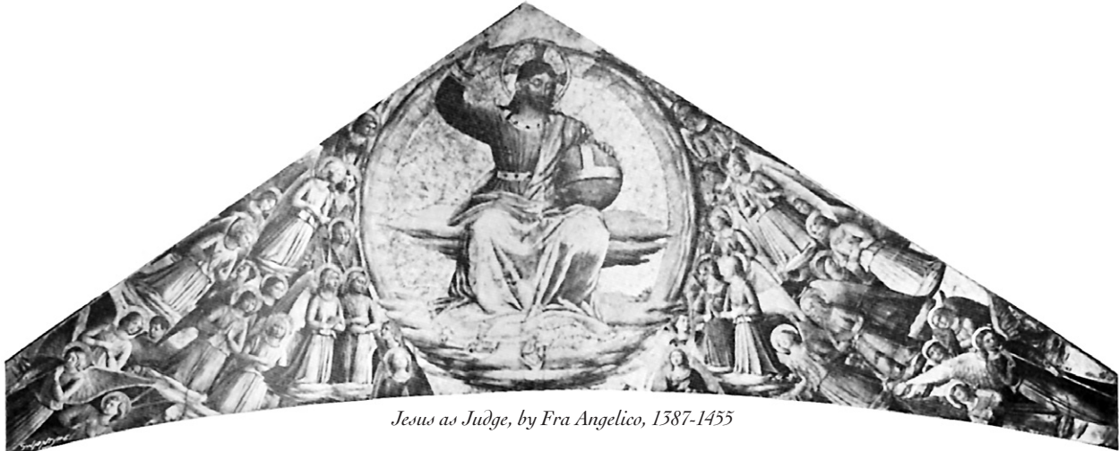
Jesus as Judge, by Fra Angelico, 1387-1455

"Jesus' Resurrection is the definitive proof of his divine authority."