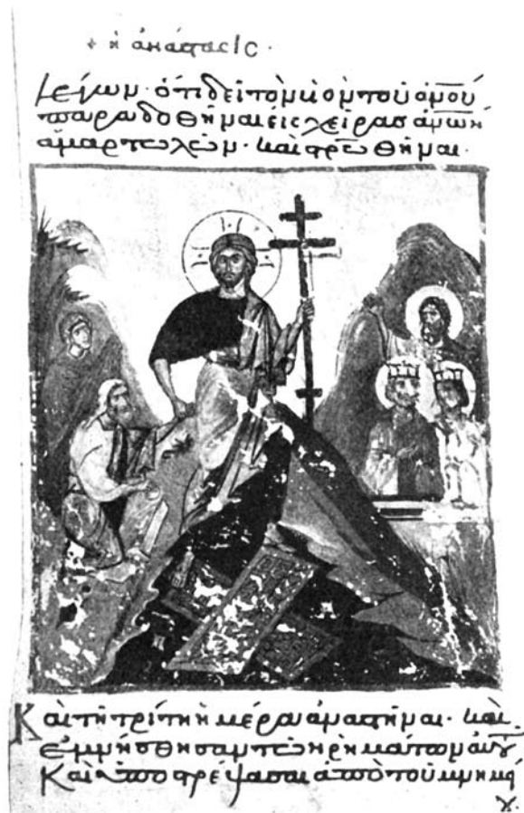
Jesus' descent to the dead, 12th century book of the Gospels

"If forgiveness is not truly sought after or desired, then God will not offer it. The proper attitude is a yearning to be reunited to God."