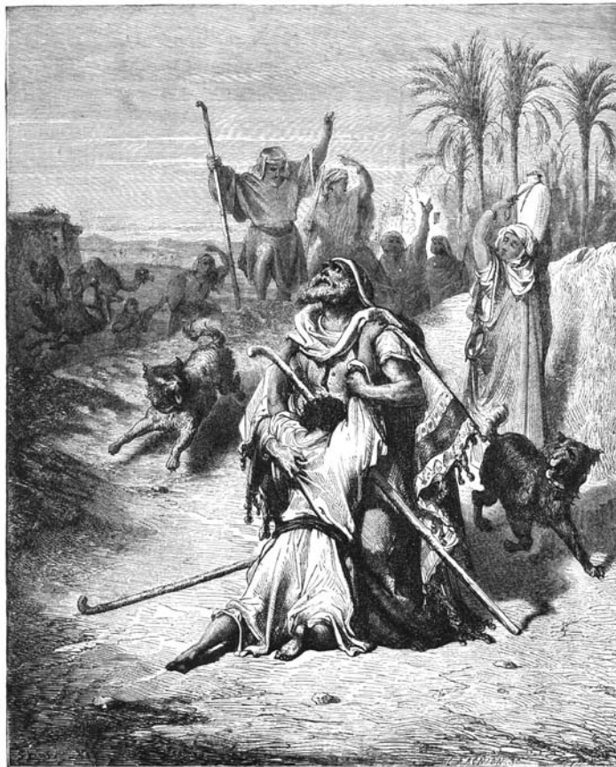
The Prodigal Son, by Gustave Doré, 1855-1885

"Through the priest, God delivers his forgiveness to the sinner."