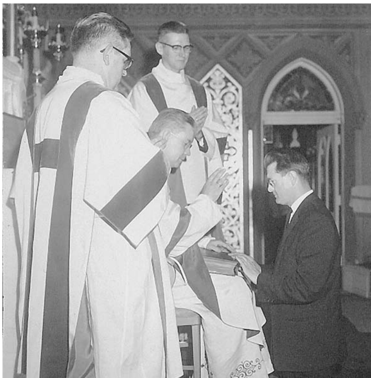
Answering an inner call from God: a man takes vows to enter religious life as a brother

"The obligation to follow the certain judgment of conscience is binding."