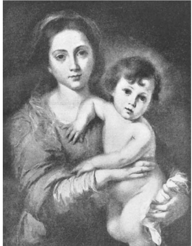
Madonna and Child, by Bartolomé Murillo, 1617-1682

Why did the second person of the Trinity assume human nature? It was 1) to save all men and women from their sins and to reconcile them to God (see 1 Jn 4:10,14); 2) so that all men and women will know God’s love (see Jn 3:16); 3) to model holiness and the