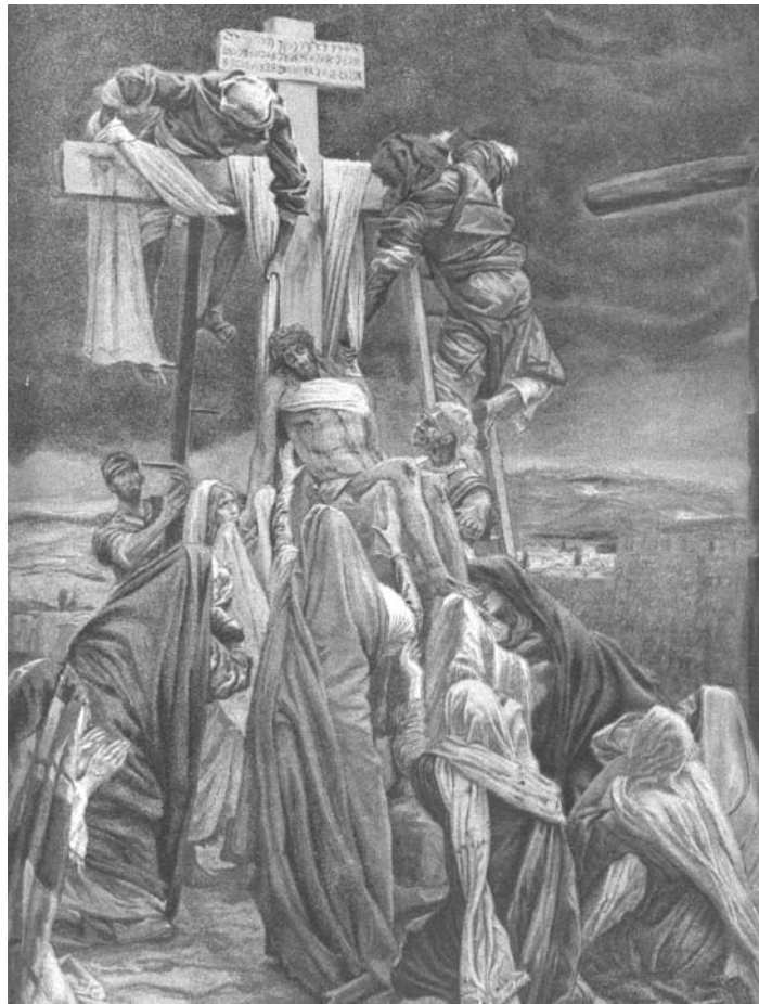
The Descent from the Cross, by James Tissot, 1856-1902

“God willed that redemption be realized in the most perfect and fitting manner possible.”